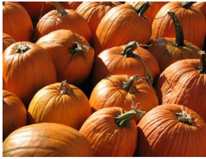
WAH MISSION – DEDICATED TO HEALTH