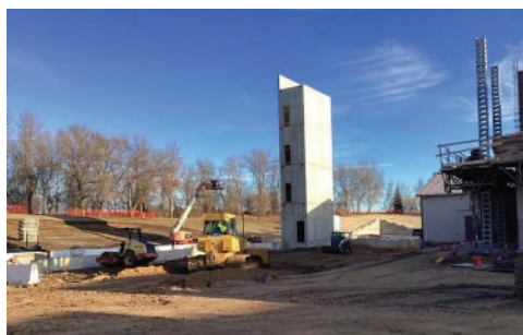
Pictured: 12/2023 North Stair Tower Completed