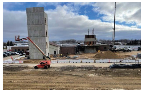
Pictured: 1/2024 View of Overall Progress So Far