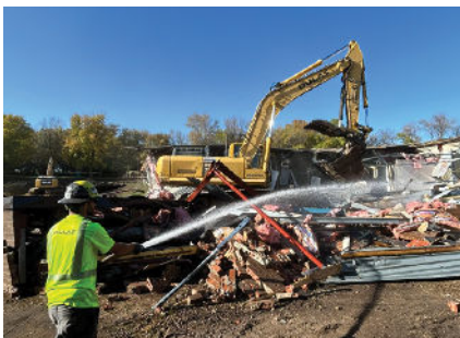
Pictured: 10/2023 Demolition of Old Clinic Space

The Medical Building project began in October of 2023 and with wonderful weather and amazing work by Kraus Anderson, we were thrilled to see so much progress. Watch the Windom Area Health Facebook Page to keep up to date with the project for 2024 and beyond!