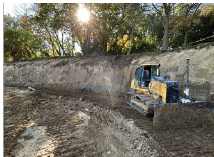
Pictured: 10/2023 Digout of Hill for Parking Lot Expansion