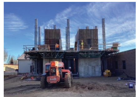
Pictured: 12/2023 Start of South Stair Tower and Elevator Shaft